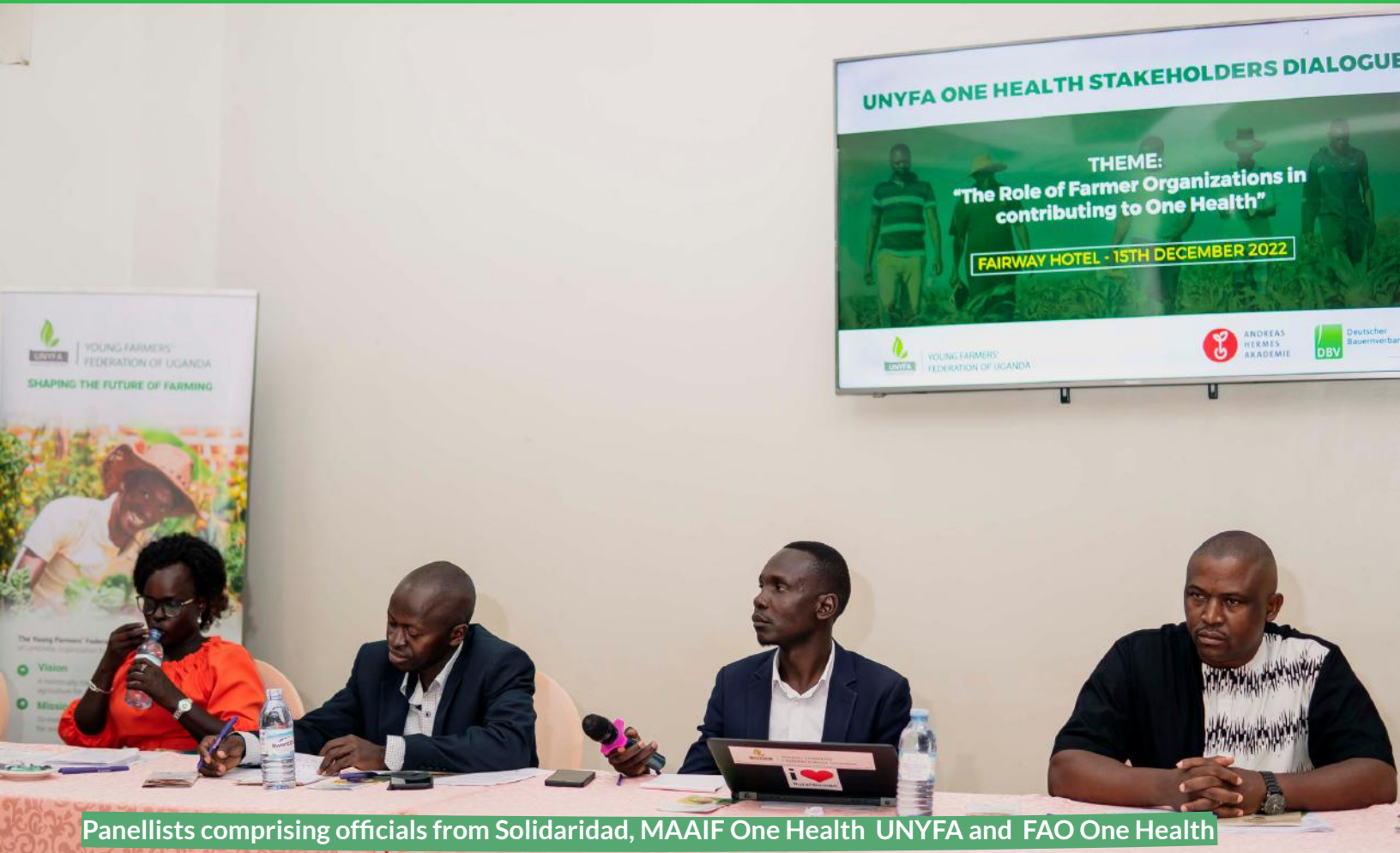
Panellists comprising officials from Solidaridad, MAAIF One Health UNYFA and FAO One Health