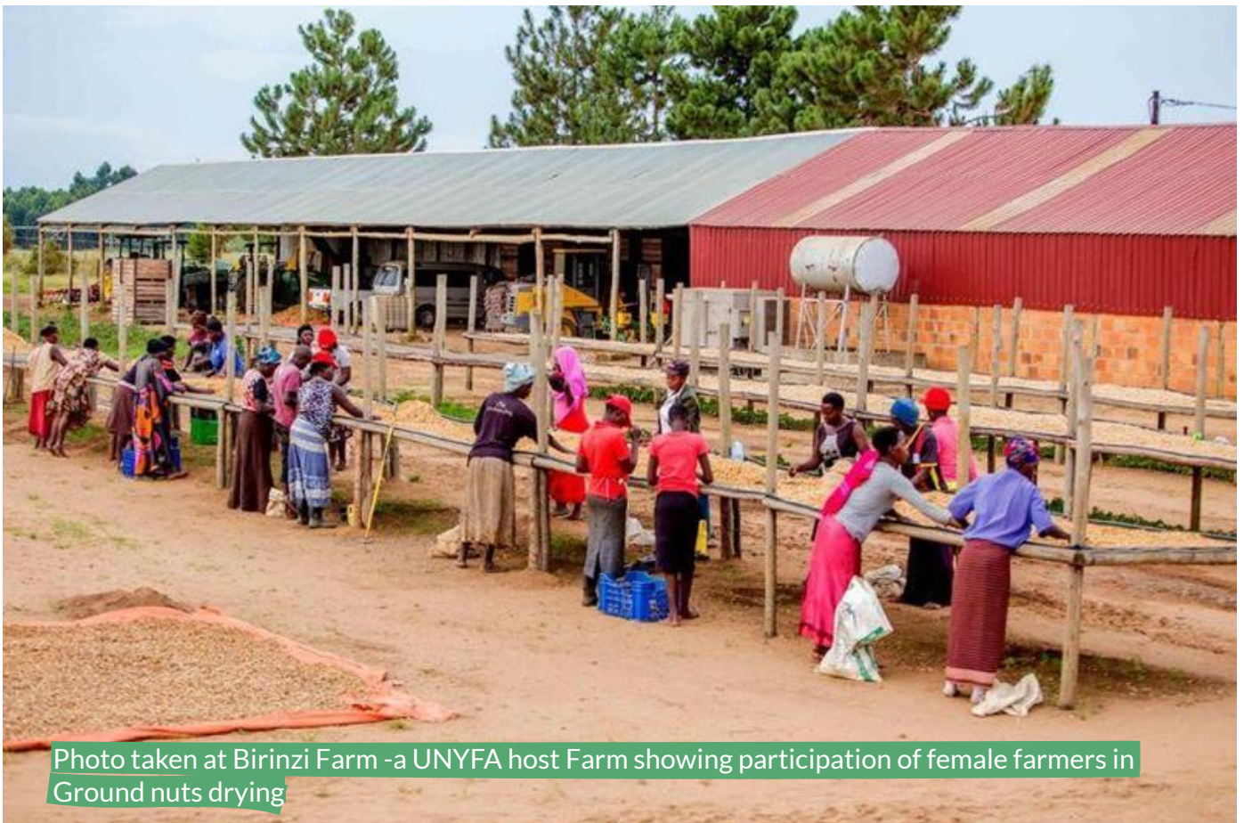
Photo taken at Birinzi Farm -a UNYFA host Farm showing participation of female farmers in Ground nuts drying

Agricultural production in Sub-Saharan Africa is a predominantly small-scale farming system, with more than 50% of the agricultural activity performed by women. As a strategy, to make our activities and services more inclusive to all genders and vulnerable groups within the organization, UNYFA embarked on the process of developing a gender policy and guidelines on how women can have an equitable footing in our activities as their male counterparts. Likewise, a growing global population and changing diets are driving up the demand for food. Climate-smart agriculture which addresses the interlinked challenges of food security and climate change is a deliberate step UNYFA is taking. UNYFA reviewed its Strategic Plan and incorporated climate-smart interventions that will enable us to be much more assertive in our climate change actions.