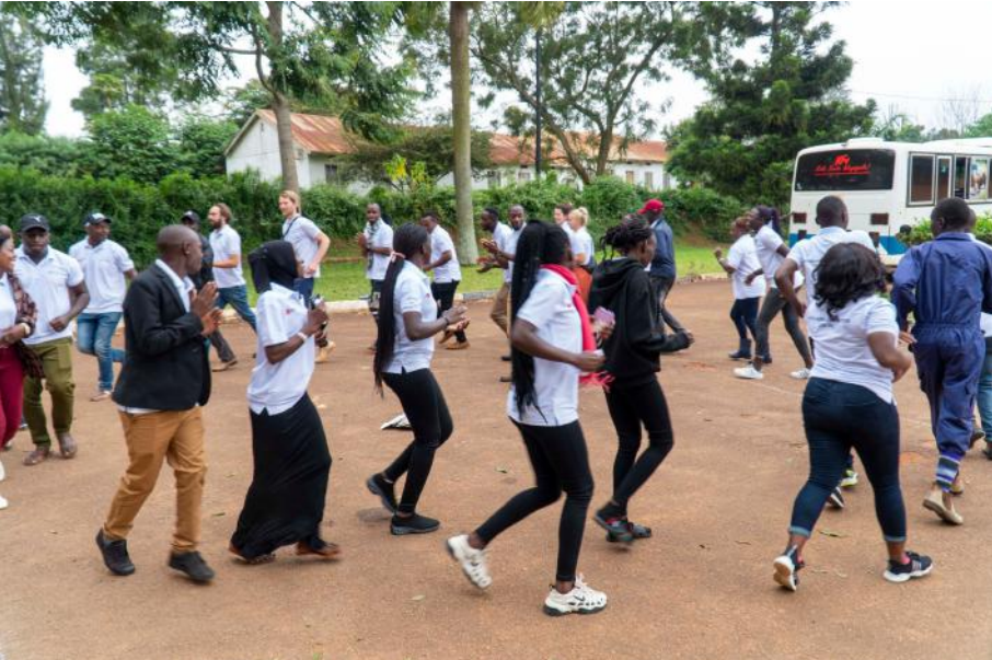
Participants of the 8th UNYFA Agribusiness tour performing a team building exercise during one of the mornings of the tour day.

UNYFA organizes annual agribusiness Tours biannually and this trip is meant to expose and offer on-farm learning experiences to young farmers and young people who want to just know more about agriculture. This year in June, we had more than 40 young farmers from across Uganda visit farms and tourism sites from Kampala, Wakiso, Mitayna, Mubende to FortPortal. The 5-day journey is summarized in this video: