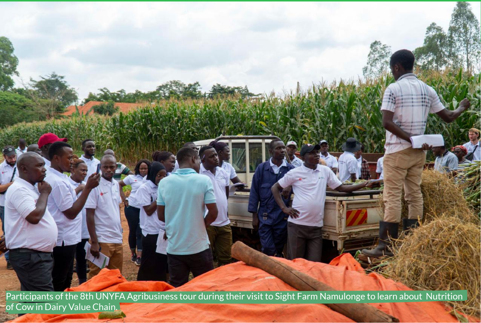
Participants of the 8th UNYFA Agribusiness tour during their visit to Sight Farm Namulonge to learn about Nutrition of Cow in Dairy Value Chain.