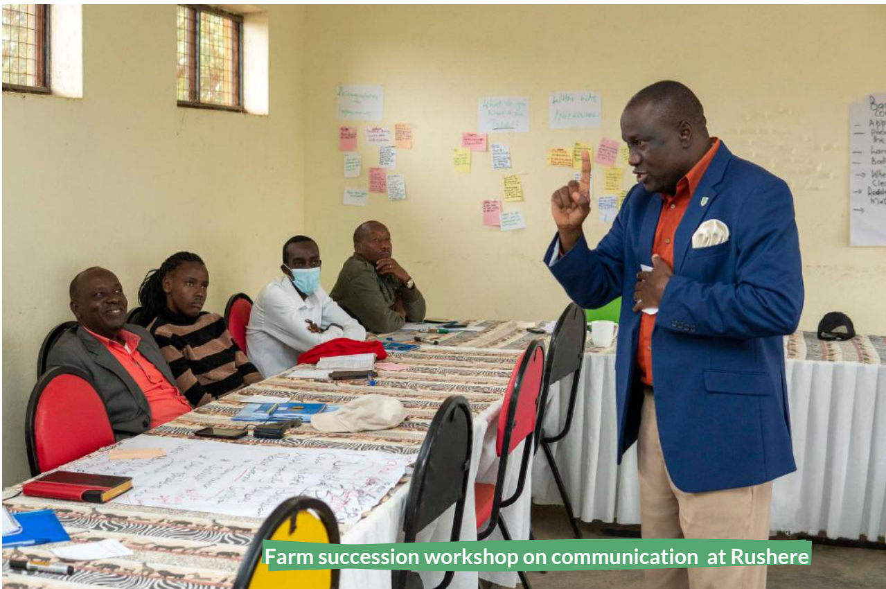
Farm succession workshop on communication at Rushere

In dairy farming, sustainability is a complex idea with many facets, including the economic the social and the environmental. It has proven to be an important source of income and employment for many people today and in years to come. Gainful participation in dairy is determined by an individual's ability to manage the barriers to entry because coming from a dairy-producing home does not necessarily result in gainful engagement in dairy production. UNYFA conducted the farm succession training for dairy farmers from Mbarara, Isingiro, Bushenyi, Ntungamo, Kiruhura, Lyantonde, Sheema, Kazo, Kamwenge, Sembabule, Kyegegwa and Kabarole. The main aim of the training was to create awareness among the farmers about farm succession as a new approach to creating employment and avail land to the young generation. It also aimed at guiding the farmers to understand what it takes for a successful transition of farm ownership. The farmers were specifically trained in communication, financial and legal aspects.