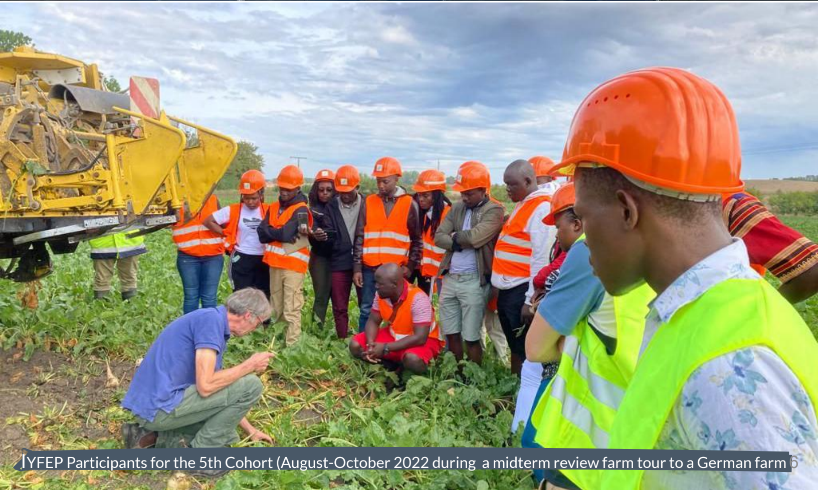
YFEP Participants for the 5th Cohort (August-October 2022 during a midterm review farm tour to a German farm 6